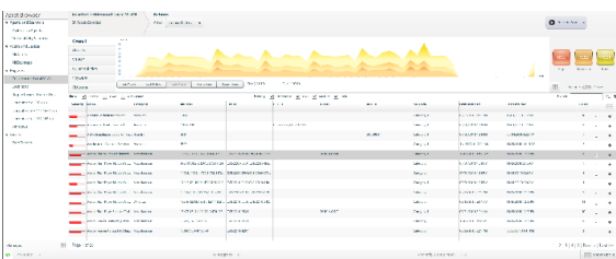
Retina CS - Vulnerability by Asset